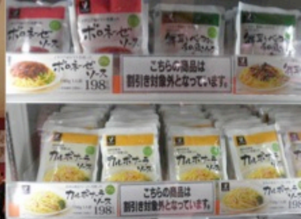
Pasta sauce, doria, beef stew, sell well. I tasted every pasta sauce, very good quality and

good taste. Frozen food is ideal for not only saving of time and money but also preserving.