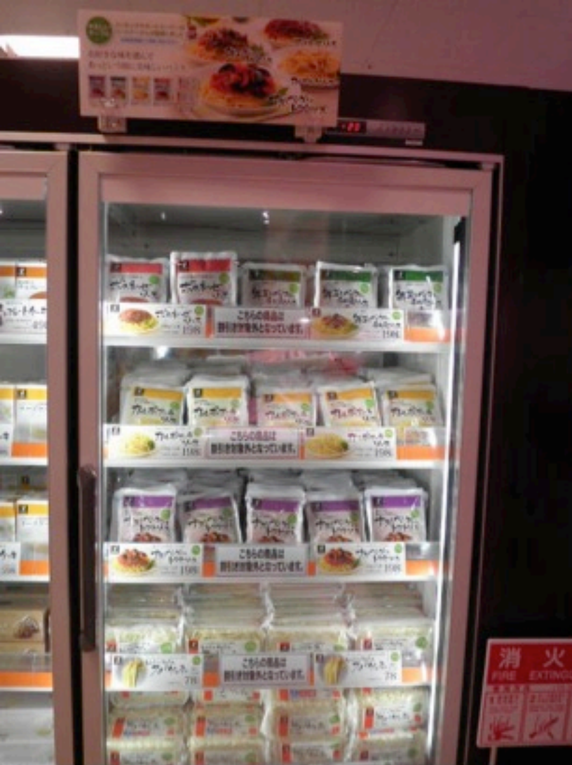
The frozen food of Yaoko is exhibited in a special freezer. They are not discounted like other frozen foods.